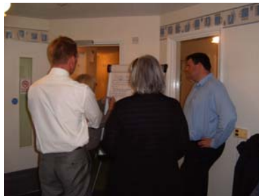
Interactive Group Exercise

The students spent the first day on theoretical issues before taking away homework which allowed them to look at the Duff-